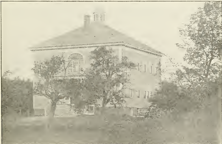
High School, Windham, Maine

At the annual meeting in 1910 the town voted to raise eight thousand dollars for the purpose of building a high school building. A large lot was purchased, and the work of building was at once begun. This progressed so favorably that, on November 28, 1910, the new edifice was dedicated with appropriate ceremonies. It is located in the pleasant village of Windham Center and is a large and commodious building of two stories in height, finished and furnished in a thoroughly modern